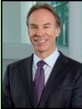
43rd CSRS President