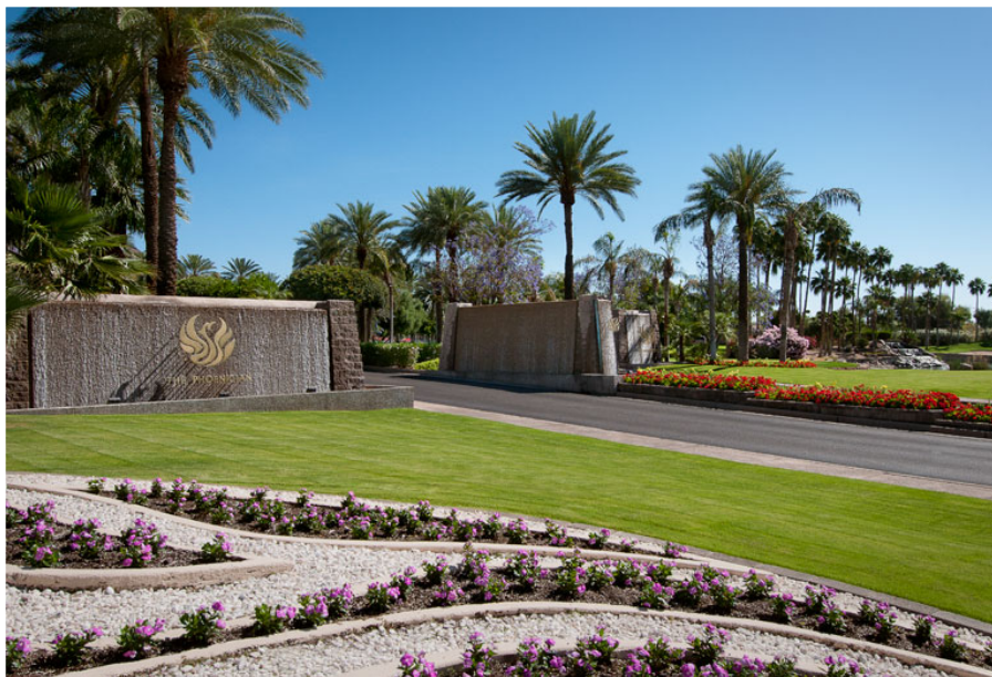
The Phoenician, Scottsdale, AZ, is the venue for the CSRS 2018 Instructional Course and Annual Meeting.

PLEASE NOTE: There is a seven (7) day cancellation requirement to avoid penalty. Any cancellations made within the 7 days prior to arrival will incur a charge of one night's room and tax